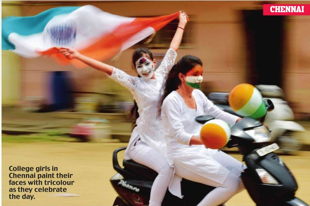
College girls in Chennai paint their faces with tricolour as they celebrate the day.

New India by 2022. "Tantra se lok nahin, lok se tantra chalega (people would be the driving force behind the establishment rather than the other way around)," he said, lamenting that democracy has been confined to ballots. "The nation had shown its collective strength between 1942 and 1947 culminating in India's Independence," he said.