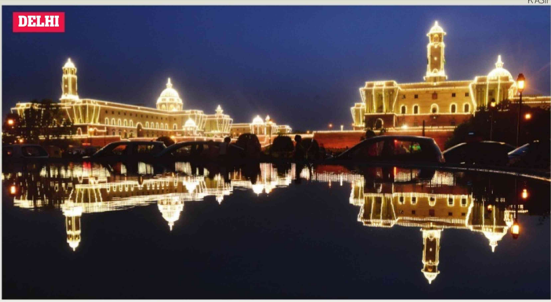
Raisina Hill is all decked up on the occasion of Independence Day on Tuesday.

NEW INDIA: Modi also asked countrymen to shed 'chalta hai' attitude and instead adopt an approach of 'badal sakta hai' (can change) for positive change. Invoking Bal Gangadhar Tilak's slogan of swaraj (self-rule), he said now their motto should be 'suraj' as he underlined his vision for a