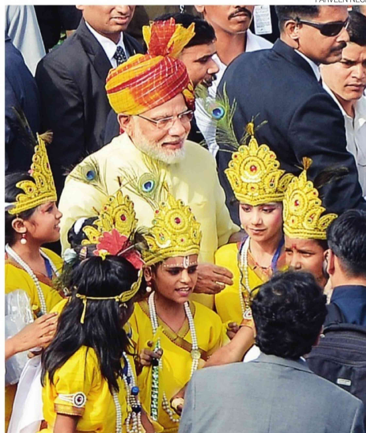
The Prime Minister broke away from his security cover to meet children, many of whom were dressed as Krishna.

BLACK MONEY: Those who have looted the nation and looted the poor are not able to sleep peacefully today. Demonetisation of old ₹500