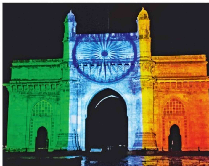
College students draped in tricolour take selfies; the Gateway of India is illuminated on the occasion.