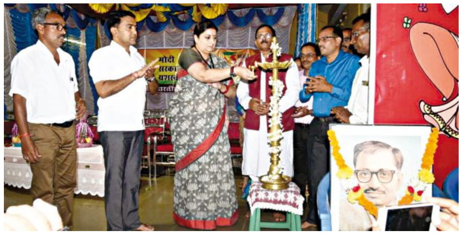
Union Minister of Textiles Smriti Irani inaugurating the programme 'Sabka Saath Sabka Vikas' at Sankhali in the presence of Shripad Naik, Dr Pramod Sawant and others

TRENDING NOW London inferno claims 12 lives