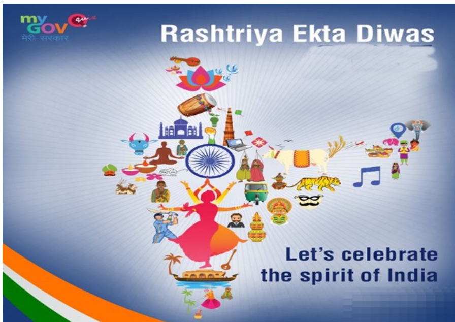
Various ministries and departments will organise 'Run for Unity'

New Delhi: Arrangements are in full swing to celebrate the 'Rashtriya Ekta Diwas' on October 31, the birthday of Sardar Vallabhbhai Patel. Several events are scheduled to be held by various ministries, PSUs and organisations across the country.