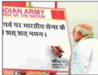
The PM writes on a board displayed during 'Parakram Parv', in Jodhpur Friday.

EXPRESS NEWS SERVICE JAIPUR, SEPTEMBER 28