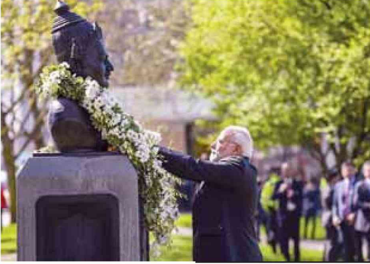
Prime Minister Narendra Modi pays homage at the statue of 12th century Indian philosopher Basaveshwara in London on Wednesday

DEALS OF BASAVESHWARA MOTIVATE PEOPLE: MODI