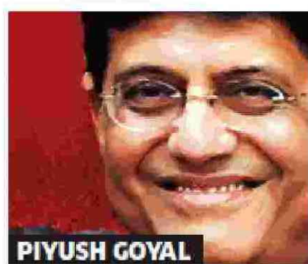
Railway & Coal Minister