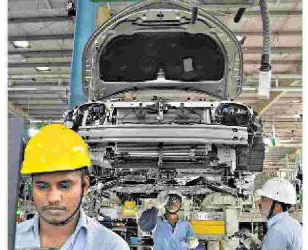
Engines running: Manufacturing, a key economic driver, has gradually regained momentum in recent quarters.