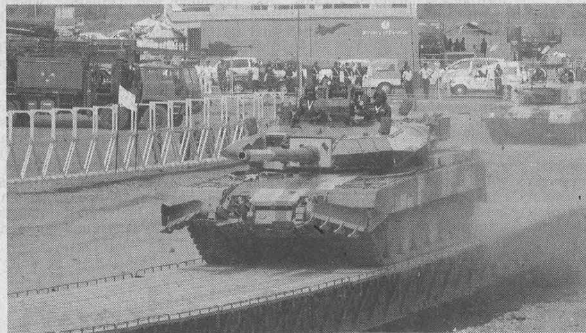
(top) India to proudly showcase the indigenous 155mm ATAG gun at DefExpo 2018

tial investment and queries related to policy and projects handled by the MoD.