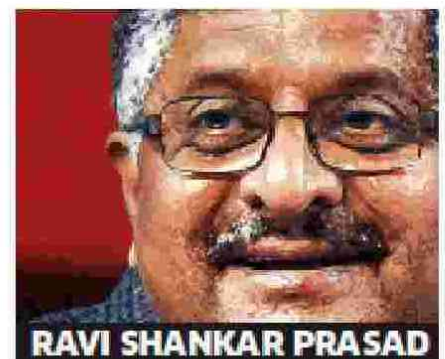
RAVI SHANKAR PRASAD