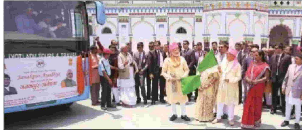
Prime Minister Narendra Modi and Nepal Prime Minister KP Oli inaugurate Janakpur-Ayodhya bus service Friday.

“I am visiting Nepal at a very special time, when elections have been success-