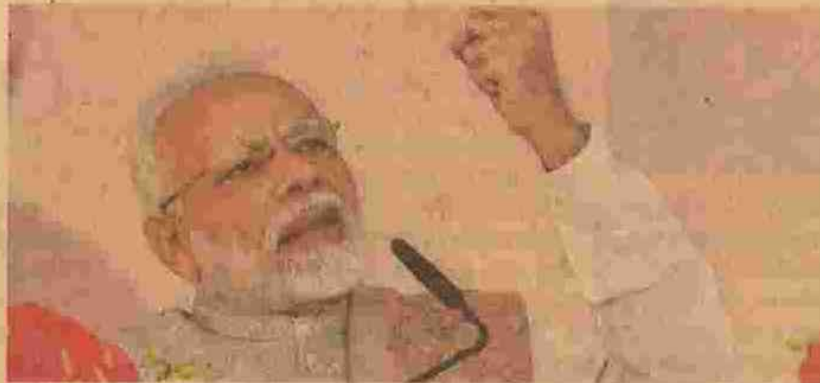
Prime Minister Narendra Modi said he has asked the GST Council to bring houses meant for the middle class in the 5% GST slab