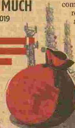
ILLUSTRATION: AJAY MOHANTY

Note: Some of these payments are under dispute, as a few companies have folded up and new owners have not cleared the older dues. Source: COAI